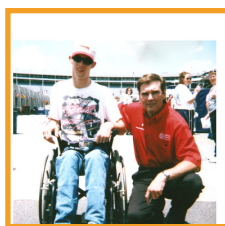
RaceCAR Waterboy LLC By Janel Green Page 14