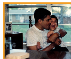
Built From the Heart By Janel Green Page 10