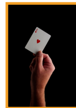
Holding an Ace By Denise Mercado Page 20