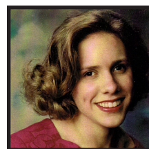
Learning to Appreciate Ourselves by Embracing Diversity By Carey Link Page 12