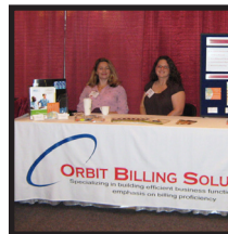
Orbit Billing Solutions: An Emphasis in Billing Proficiency By Janel Green Page 20