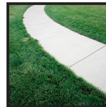
Sidewalks to Nowhere explores issues with accessible sidewalks By Denise Mercado Page 24